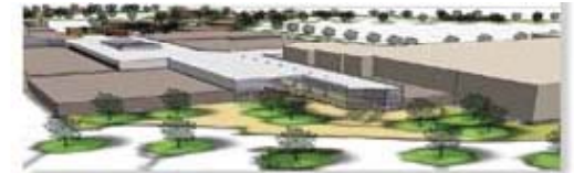
Food Court Plaza